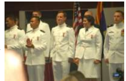
Nineteen new Navy and Marine officers were sworn in & received their shoulder boards, hats, and first salutes...from parents, wives, children, military personnel.