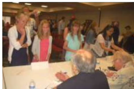
Veterans signing friends and families' books.